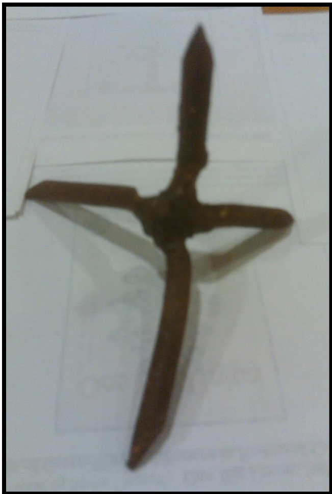
An example of a “mountain spider”

darkness, but they had the near complete solidarity of their families, friends, neighbors, and community, and they were not alone. 152 The strike spread beyond merely the Pittston Coal Company. Pittston subsidiary, Elkay Mining Company had gone as far to bring in a two professional scab operations in succession (the first went bankrupt and was replaced with a second company known as “Con-serv, Inc.”) after workers there engaged in wildcat strikes in July. When A.T. Massey Coal Company reopened their Rum Creek mine, the strike spread to all of Massey’s nonunion operations. By September, with the help of the UMWA, union and nonunion workers began engaging in direct action tactics, including building barriers—some of them constructed of old tires, railroad ties, and even a soggy abandoned couch—to keep scabs out of the struck mines 153